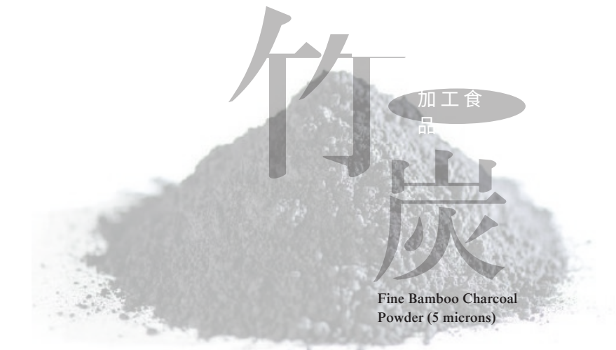
Bamboo Charcoal Powder Supporting Nature with Nature To achieve more effective use of bamboo charcoal, the carbonization process was applied, and ultra-fine bamboo charcoal

Yamashita Kogei Co., Ltd The Eco Mark is a label given to products that are judged by the Japan Environment Association to be "helpful for environmental conservation and have a low impact on the